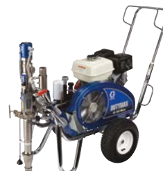
DUTYMAX™ GH300 HD STANDARD