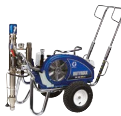
DUTYMAX™ EH300 HD STANDARD