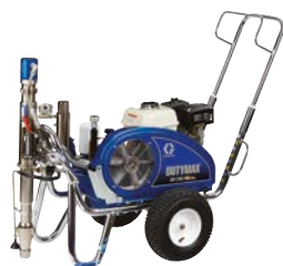
DUTYMAX™ GH230 HD STANDARD