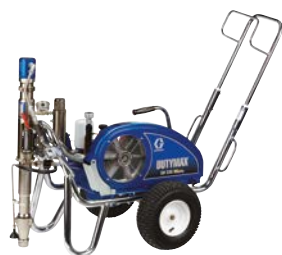
DUTYMAX™ EH230 HD STANDARD