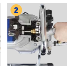
2 Remove pump section