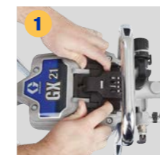
1 Slide & lift open access door